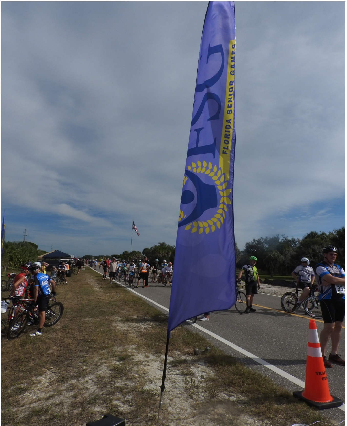
2015 Florida Senior Games Complete Wrapup December 5-13, 2015 Clearwater, Florida