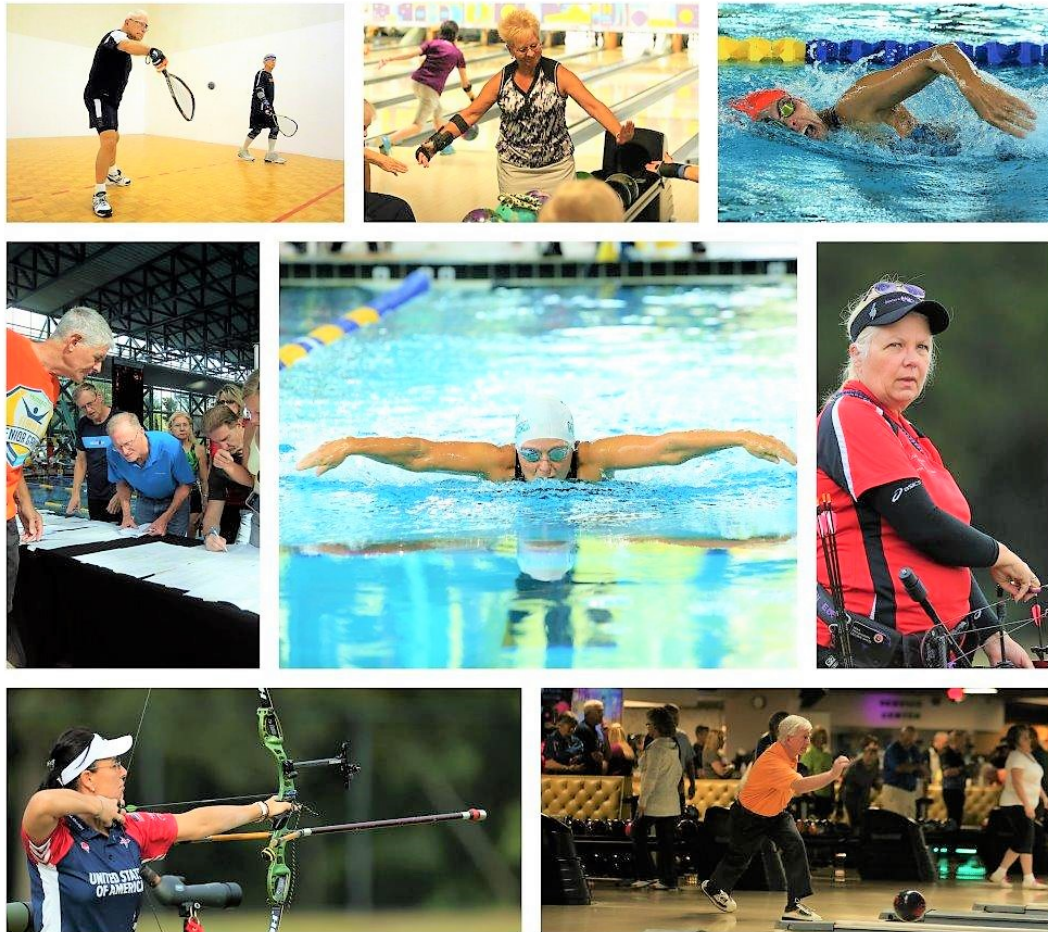
Athletes from throughout the Sunshine State are competing in the 2018 Florida Senior Games, which run through Sunday, Dec. 9 in Clearwater/Pinellas County.