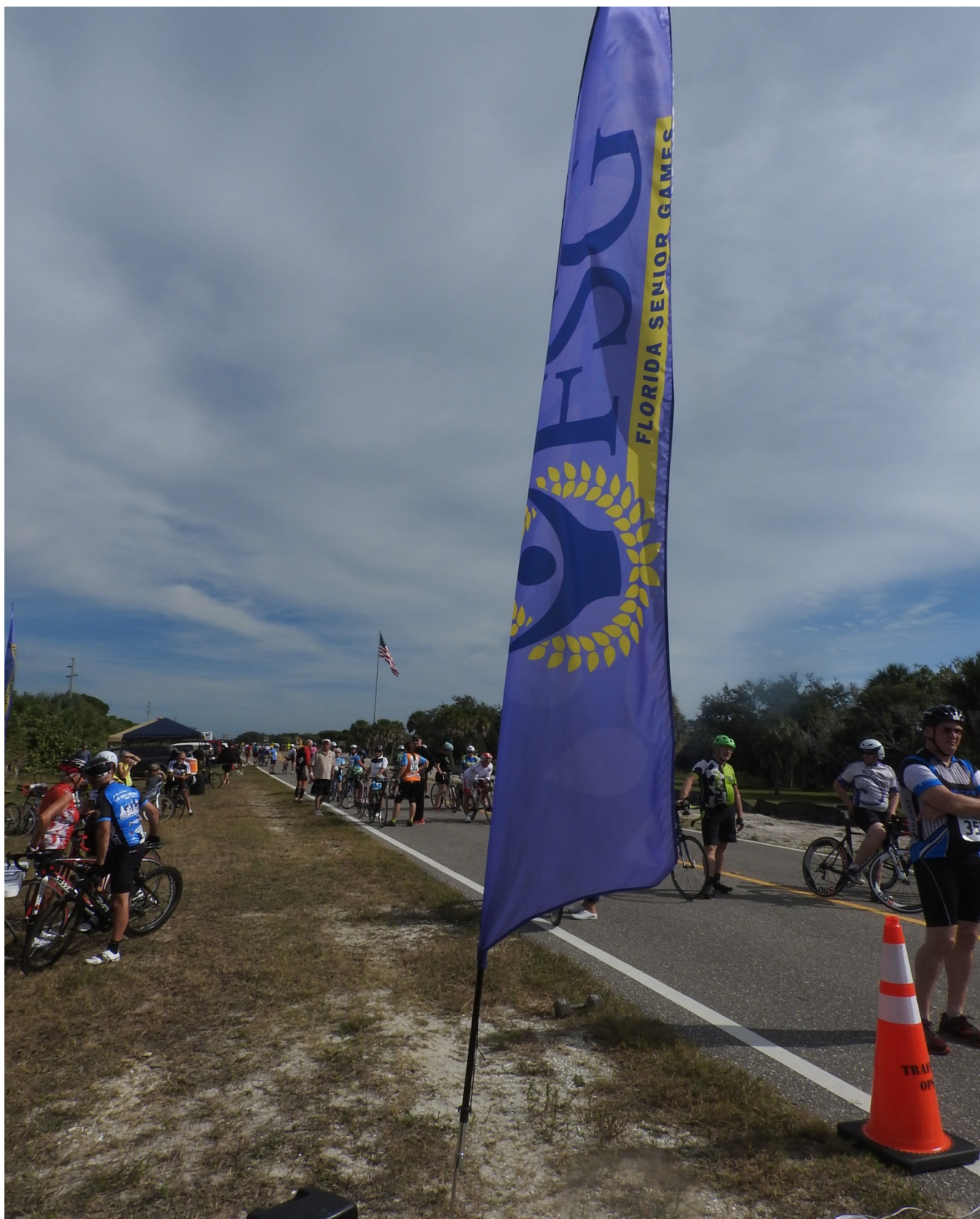
2015 Florida Senior Games Complete Wrapup December 5-13, 2015 Clearwater, Florida